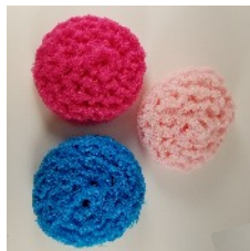
Scrubbies Potholders Kitchen towels