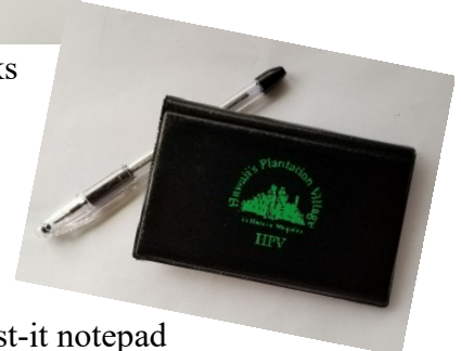
Post-it notepad with Pen