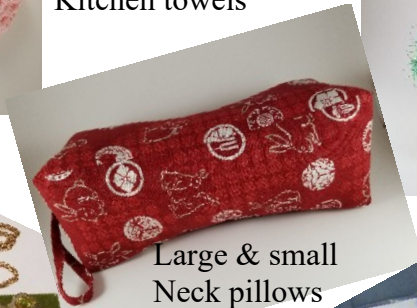
Large & small Neck pillows