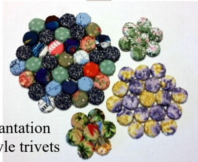
Plantation style trivets