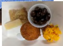
Ethnic food bowl