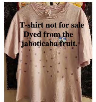
T-shirt not for sale Dyed from the jaboticaba-fruit.