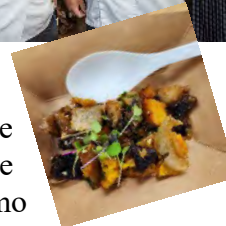
veggie poke demo