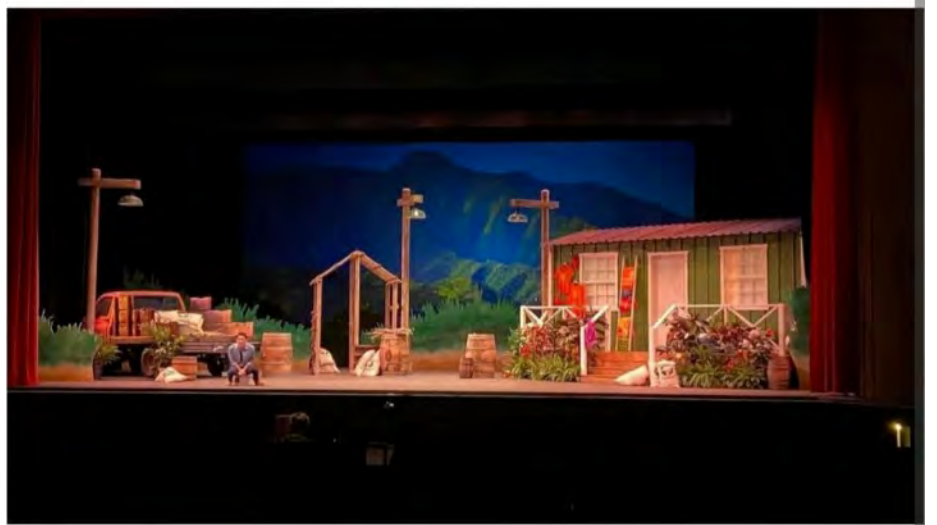
Stage production photo by Hawaii Opera Theater

On February 17 and 19, we were honored to have Hawaii Opera Theater invite us to set up a display and promote Hawaii's Plantation in the lobby of the Neal Blaisdell Concert Hall for their performances of "Elixir of Love". The original opera by the Italian composer Gaetano Donizetti premiered in 1832. HOT adapted the play to take place in Hawaii for a more contemporary audience, and after a visit to our outdoor museum, their scenery designer created a backdrop that looked as real as a visit to our village. They constructed the set in their Waipahu workshop.